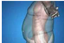
These 2 Veggies Melt Belly & Arm Fat Overnight