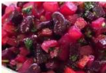
Endocrinologists Stunned: Forget Metformin, This "Fixes" Your Diabetes (Watch)