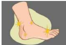
Neuropathy & Nerve Damage? Do This Immediately (Watch)