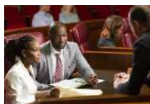
Walmart Center for Racial Equity Update: Advancing Equity in Criminal Justice