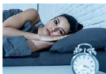
The Close Relationship Between Stress and Sleep

Heading straight for the tasting room, I sipped on its award-winning Rosé, marveling at the stunning views of the rolling hills and sprawling vineyards stretching endlessly around me. Varietals like Vermentino, Tempranillo, and Petit Verdot thrive in this region's unique soil and climate, producing bold and complex wines that catch the attention of wine critics and enthusiasts alike.