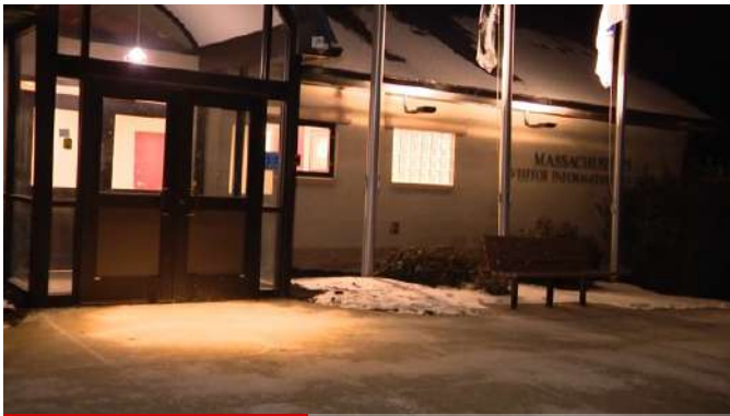
Originally published on mediadecision.com , part of the BLOX Digital Content Exchange .