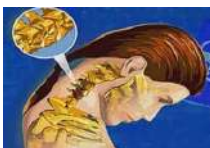
Tinnitus Discovery Leaves Doctors Speechless (Try Tonight)