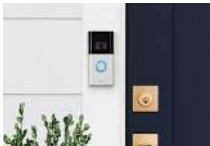
Achieve Total Peace of Mind With Ring Devices