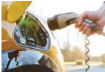
Should You Buy an Electric Car?