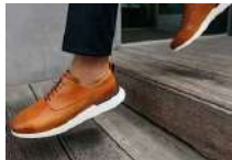
Get Ready to Rethink Your Workplace Shoe Game