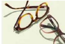
We've Got Your Eyes Covered - Find Your Perfect Pair!