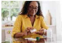
Stop Paying Too Much for Your Prescriptions - Compare Prices Today