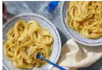
Take on a Challenge: Make Pasta Al Limone at Home

Ngala, meaning "lion" in the local Shangaan language, lives up to its name. Located within a private concession bordering South Africa's famed Kruger National Park, this exclusive tented camp offers an unparalleled front-row seat to the African wild — without the crowds. Wildlife roams freely with no fences separating Ngala from Kruger, and each day is a masterclass in nature's raw beauty.