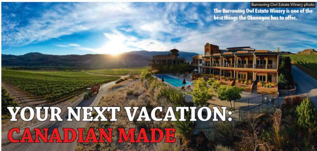
Burrowing Owl Estate Winery photo

The Burrowing Owl Estate Winery is one of the best things the Okanagan has to offer.